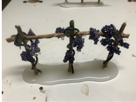
Photo 6/ snipping off small bunches of the dollar store flora pick, hot glue them to your vines all over the wires

Photo 7/ again go to your flora pick, snip off individual leaves and hot glue them on to the nearly completed