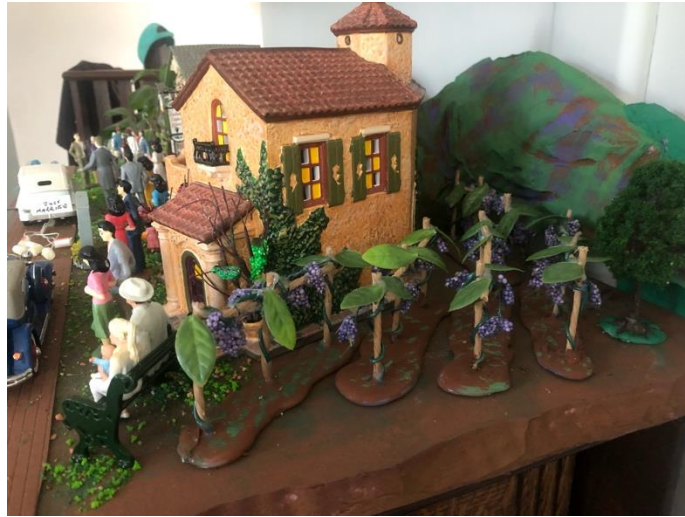
Photo 9/ in place at your winery vignettes