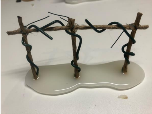
Photo 5/ using lengths of stem wire, wrap around upright posts and on to crossbar, then wrap the 22 gauge wire left long around crossbar