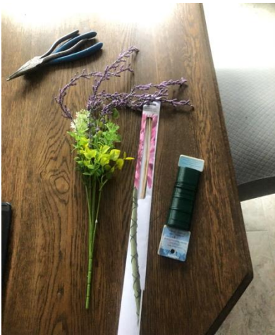
Photo 1/ supplies needed, flora stem wire, 22 gauge wire, flora stem like in photo from dollar store, hot glue, and paint