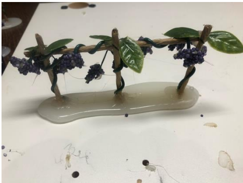
Photo 7/ again go to your flora pick, snip off individual leaves and hot glue them on to the nearly completed

Photo 6/ snipping off small bunches of the dollar store flora pick, hot glue them to your vines all over the wires