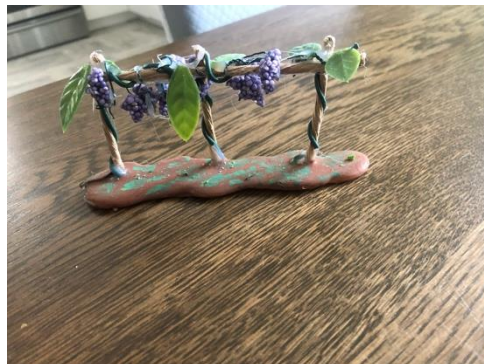
Photo 8/ paint your base and there is your finished vine